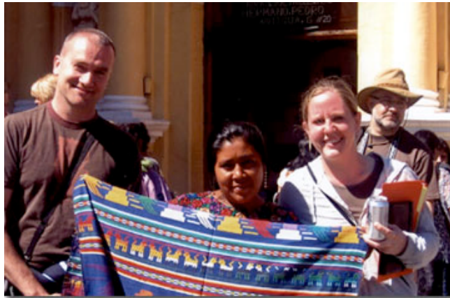
DiGioia Family Challenge Grant

Operation Walk Pittsburgh is a not-for-profit volunteer medical service program that provides free surgical treatment to patients with disabling arthritis in developing countries. Operation Walk also educates in-country orthopaedic surgeons, nurses, physical therapists and other health care professionals on the treatments, processes and surgical techniques for diseases of the hip and knee.