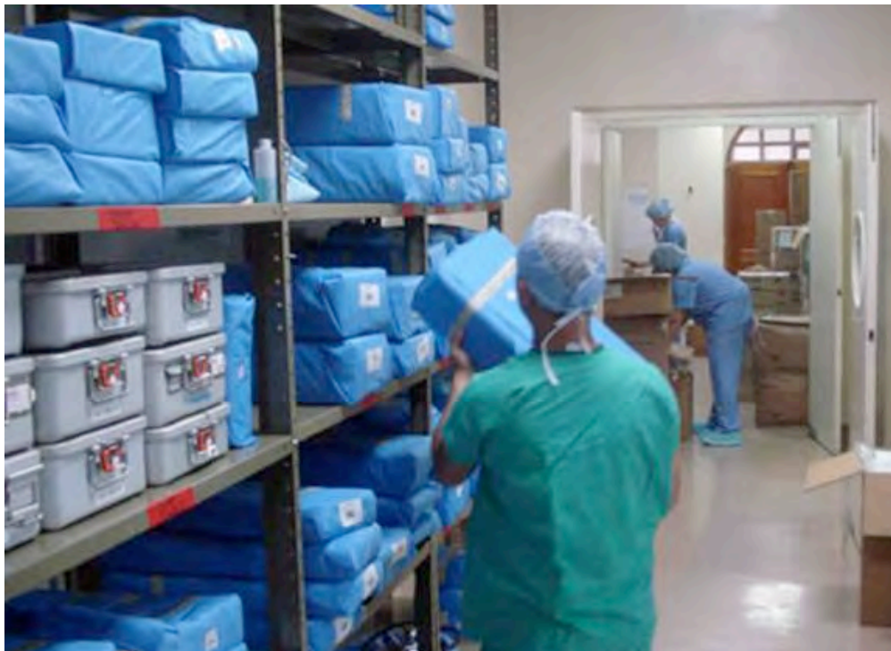
The operating room staff prepares to load and ship left over equipment.

Today was the first non-surgical day since arriving in Guatemala. After three and a half days of operating, the team was able to replace 63 hip and knee joints! The operating room staff took great pride in the long hours worked and the number of Guatemalan people they helped. However, there was no rest for the weary as they had to re-pack all of the surgical equipment and implants to ship back to be used by another Operation Walk team on a future trip.